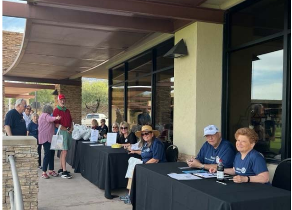
Lots to do and fun to have!