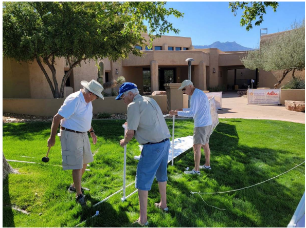
All in Volunteers!

Members' Registration for Post Tournament Dinner and Awards Presentation