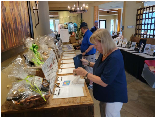
Raising a little money for our Foundation!